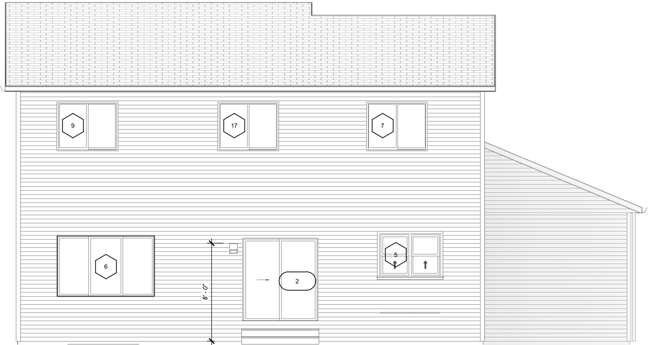
1 Rear Elevation 1/8" = 1'-0"