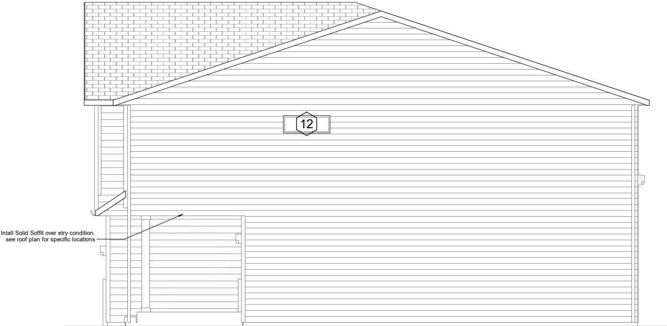
1 Left Elevation 1/8" = 1'-0"