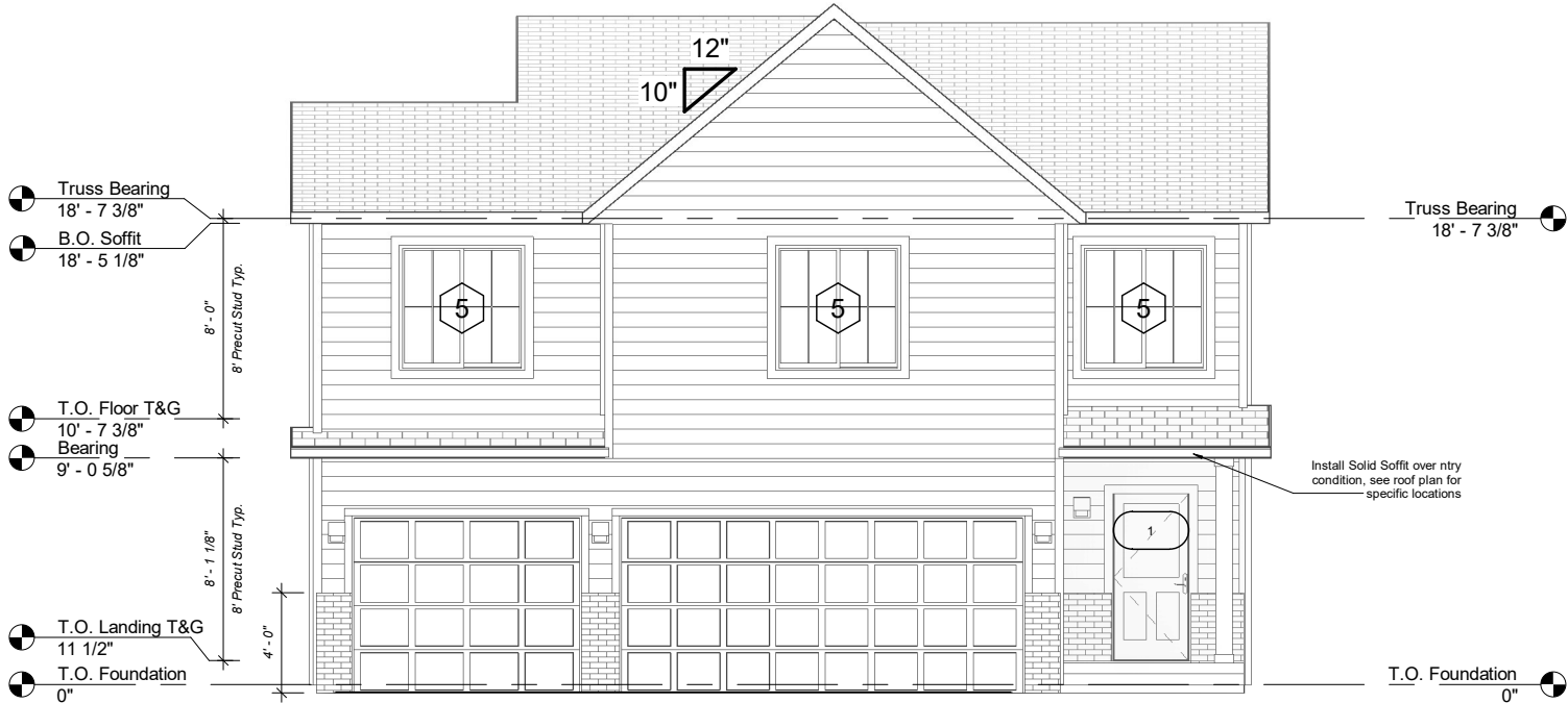
1 Front Elevation 1/8" = 1'-0"

Disclaimer: Plans were neither prepared by, nor under the supervision of a professional Architect or Engineer. Responsibility for the usage of correct structural materials, spans, load bearing and construction methods are the responsibility of the respective trades.