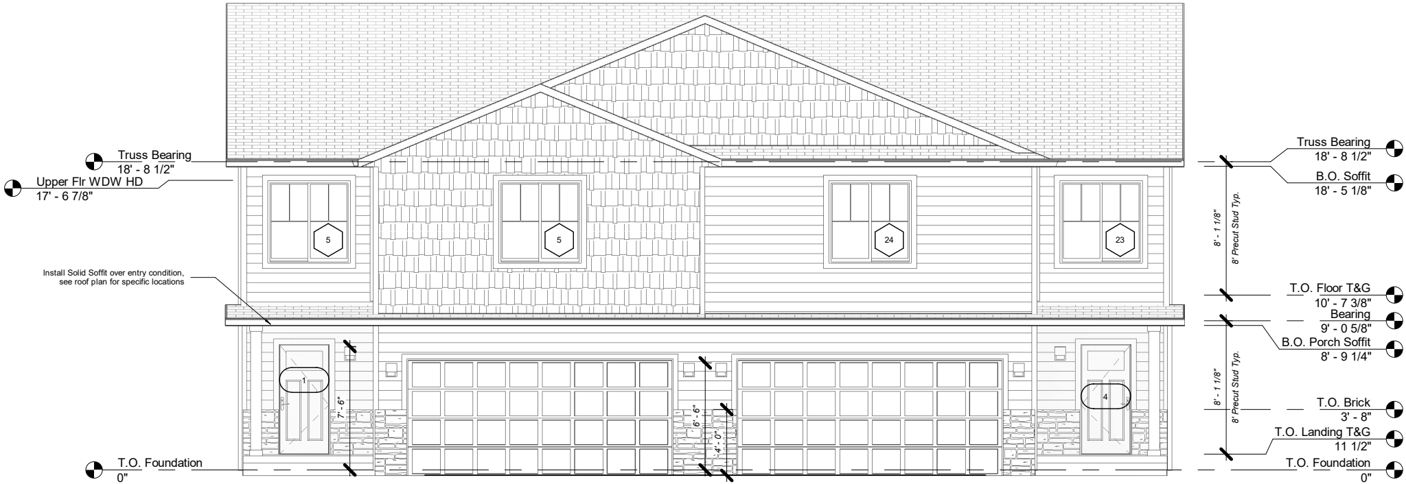
1 Front Elevation 1/8" = 1'-0"