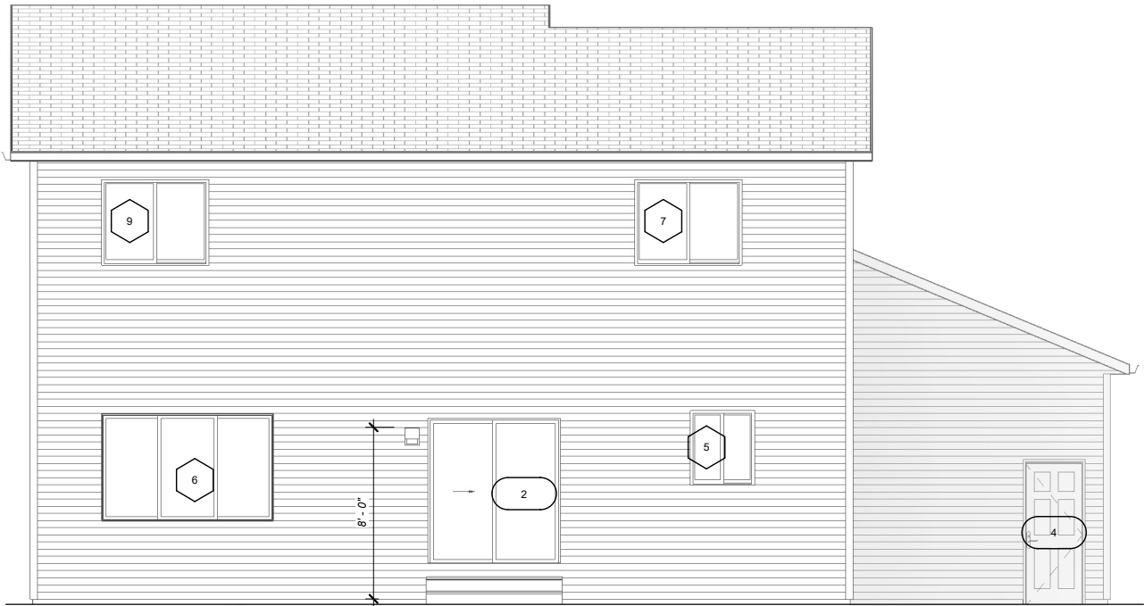
1 Rear Elevation 1/8" = 1'-0"